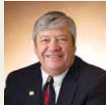
Art Rodarte Kit Carson Electric